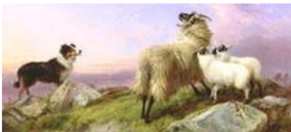
- Painting by Richard Ansdell R.A.