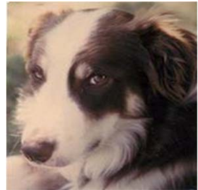
Woolgather Moss 1984-1999